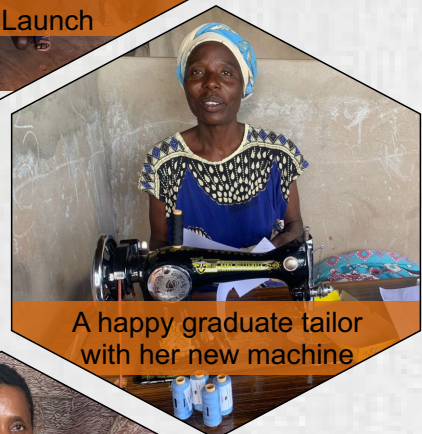
A happy graduate tailor with her new machine