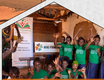
Giriama Centre excited after Project Launch