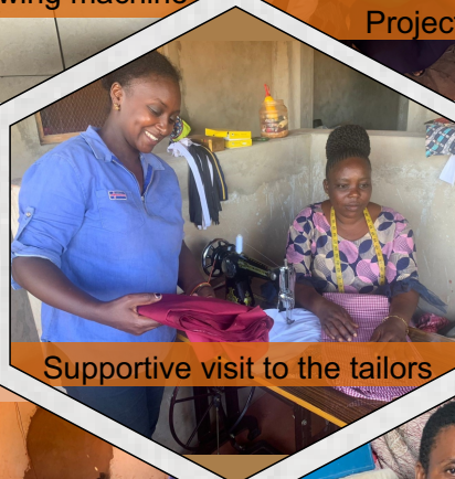
Supportive visit to the tailors