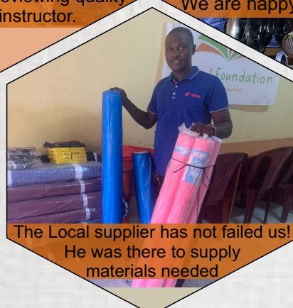
The Local supplier has not failed us! He was there to supply materials needed