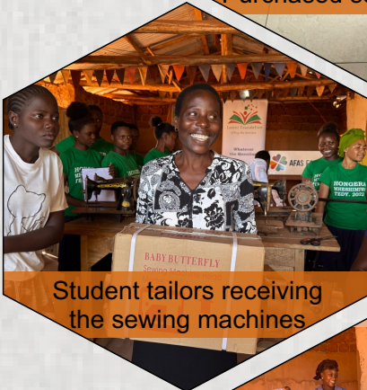
Student tailors receiving the sewing machines