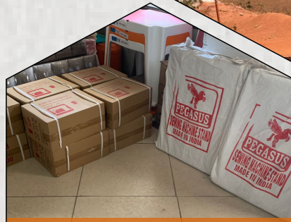
Purchased sewing machine