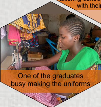
One of the graduates busy making the uniforms