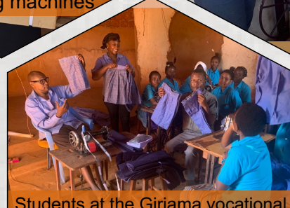
Students at the Giriama vocational tailoring centre reviewing quality with their instructor.